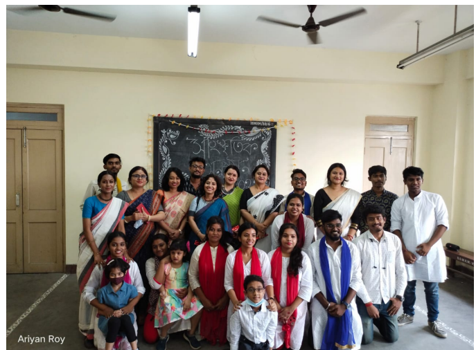
of other faculty members of DDMRM. Also, some beautiful Photographs were clicked at the end which will be cherished by the

The Head and the other Faculty members of the Geography Department arranged a beautiful cake for the lovely studentsthat had been cut by the teachers and students