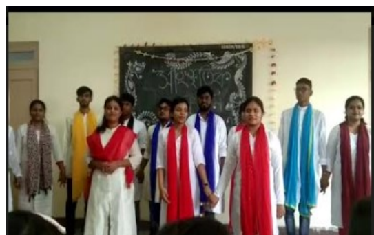
all the audiences.